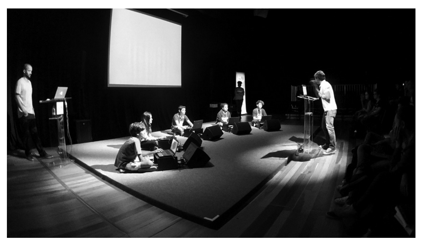
Figure 2: Laptop orchestra performers making eye contact with the conductor

The workshop main goal was to sensitize students and the general public to the beauty of the relationships between music, mathematics and computers. In order to achieve this goal, we have explored several connections between musical structures, mathematical concepts and computer implementation methods. Our challenge was to provide a rousing atmosphere that could inspire children and teenagers in their learning paths.