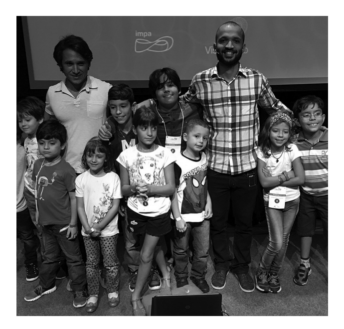
Figure 3: A laptop orchestra portrayed in the Math Festival

introduced. Notably, the teachers expressed their interest in reproducing the workshop in their local learning environments. Hence, they asked for supportive digital material and technical guidance. Finally, children were delighted for having had the opportunity to take part in our laptop orchestra (Figure 3). They shared their thoughts on how to improve the overall performance.