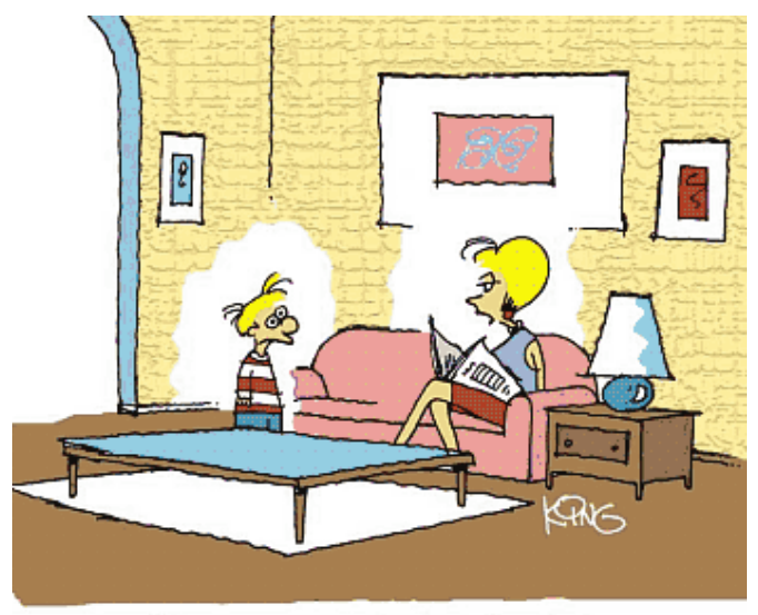
"No, you weren't downloaded. Your were born."

In tables, do not use colored or shaded backgrounds, and avoid thick, doubled, or unnecessary framing lines. When reporting empirical data, do not use more decimal digits than warranted by their precision and reproducibility. Table caption must be placed before the table (see Table 1) and the font used must also be Helvetica, 10 point, boldface, with 6 points of space before and after each caption.